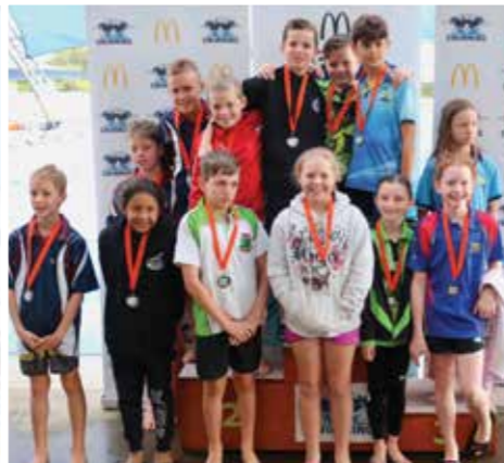
COMPLETE MEDAL CHAMPIONS