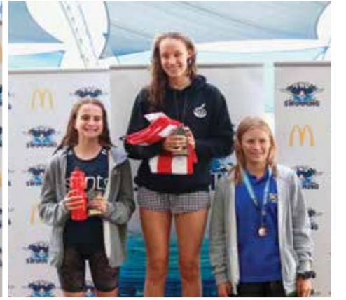
GIRLS AGE CHAMPIONS 12 YEARS