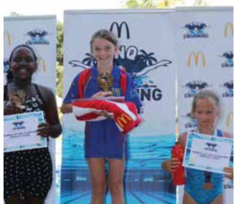
GIRLS AGE CHAMPIONS 8 YEARS