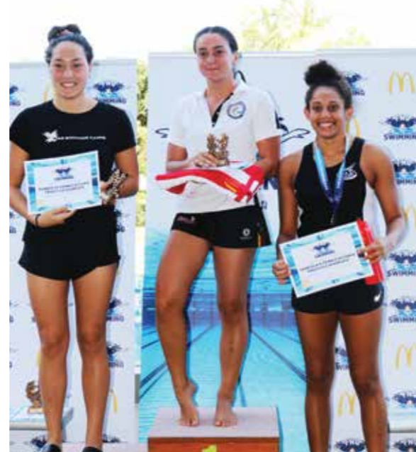
15&0 GIRLS DISTANCE FREESTYLE CHAMPIONS