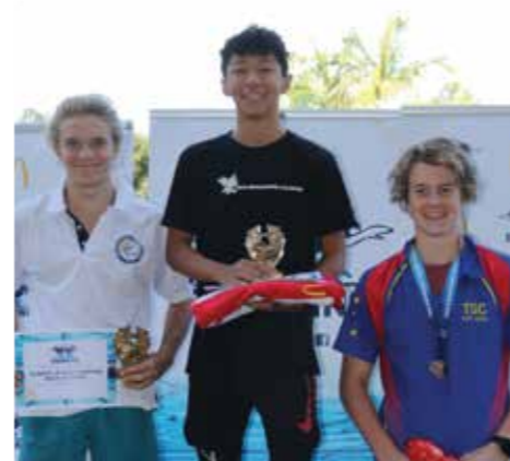
BOYS AGE CHAMPIONS 15 YEARS