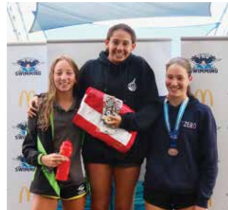
GIRLS AGE CHAMPIONS 14 YEARS