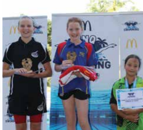
GIRLS AGE CHAMPIONS 10 YEARS