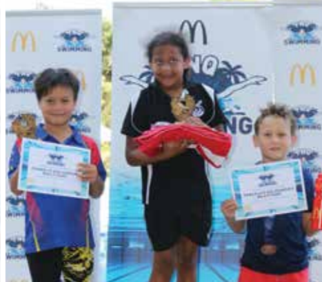
BOYS AGE CHAMPIONS 8 YEARS