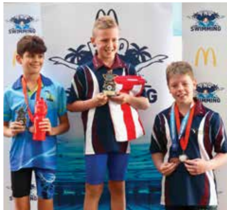
BOYS AGE CHAMPIONS 9 YEARS