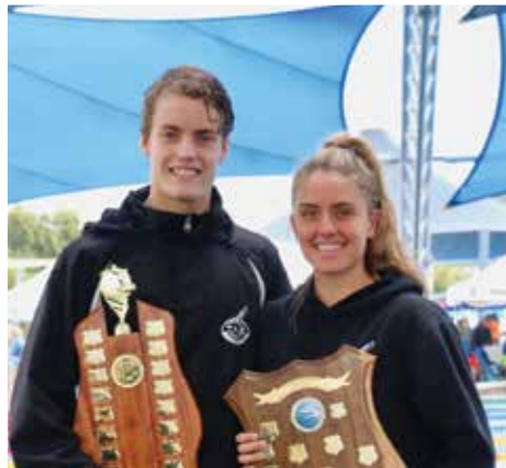
RELAY & CLUB CHAMPIONS - TAS