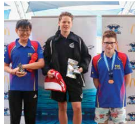
BOYS AGE CHAMPIONS 12 YEARS