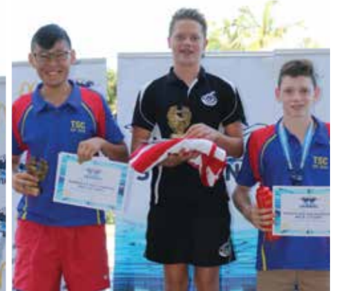
BOYS AGE CHAMPIONS 13 YEARS