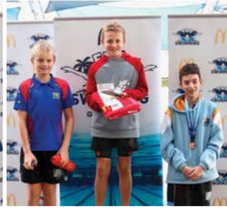
BOYS AGE CHAMPIONS 11 YEARS