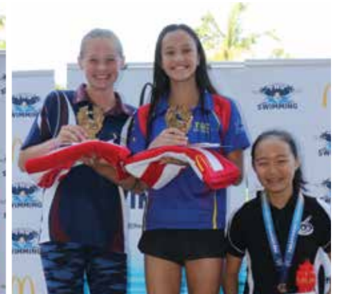
GIRLS AGE CHAMPIONS 12 YEARS