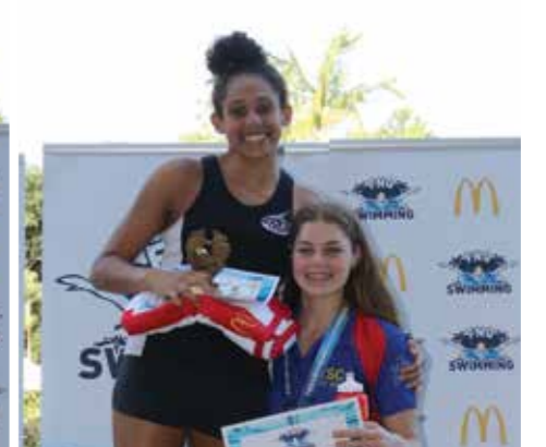
GIRLS AGE CHAMPIONS 15 YEARS