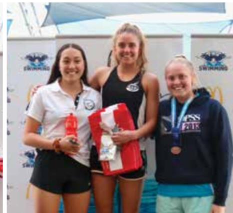
GIRLS AGE CHAMPIONS 16&0 YEARS