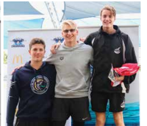
BOYS AGE CHAMPIONS 16&0 YEARS