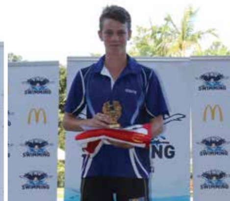
BOYS AGE CHAMPIONS 14 YEARS