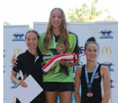
GIRLS AGE CHAMPIONS 14 YEARS