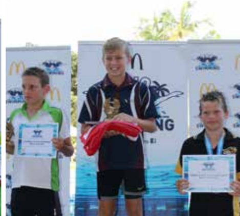
BOYS AGE CHAMPIONS 10 YEARS