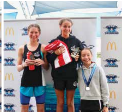
GIRLS AGE CHAMPIONS 13 YEARS