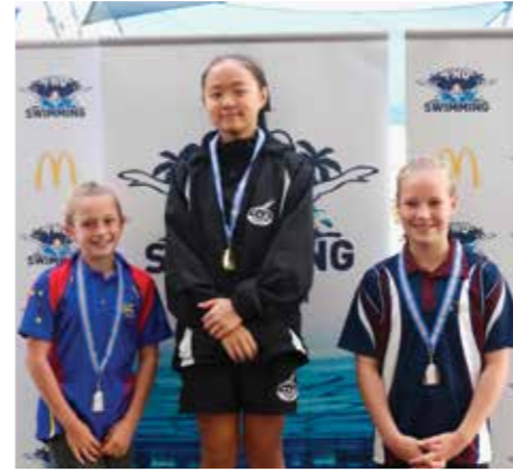
GIRLS AGE CHAMPIONS 11 YEARS