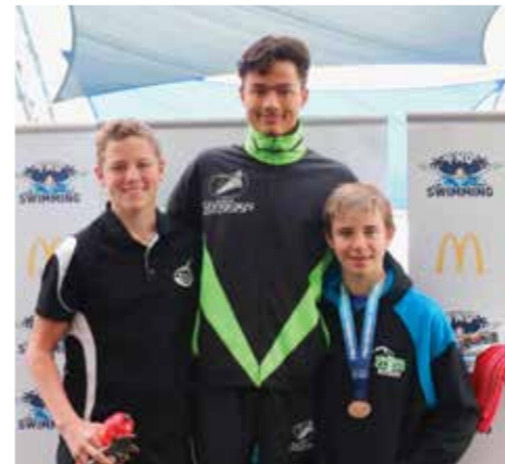
BOYS AGE CHAMPIONS 15 YEARS