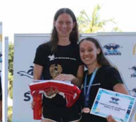
GIRLS AGE CHAMPIONS 13 YEARS