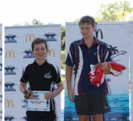
BOYS AGE CHAMPIONS 11 YEARS