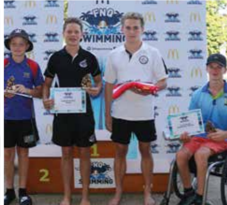
PERPETUAL TROPHY AWARDS