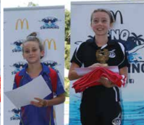
GIRLS AGE CHAMPIONS 9 YEARS