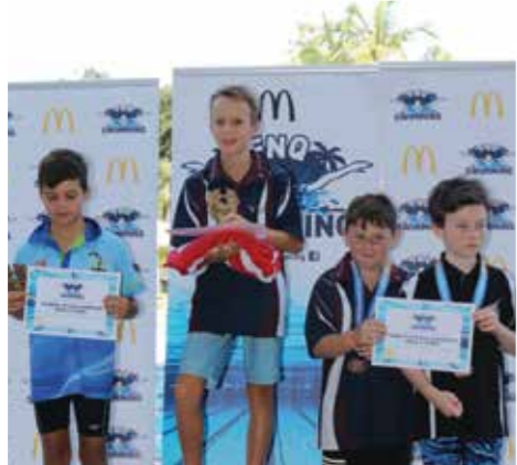
BOYS AGE CHAMPIONS 9 YEARS