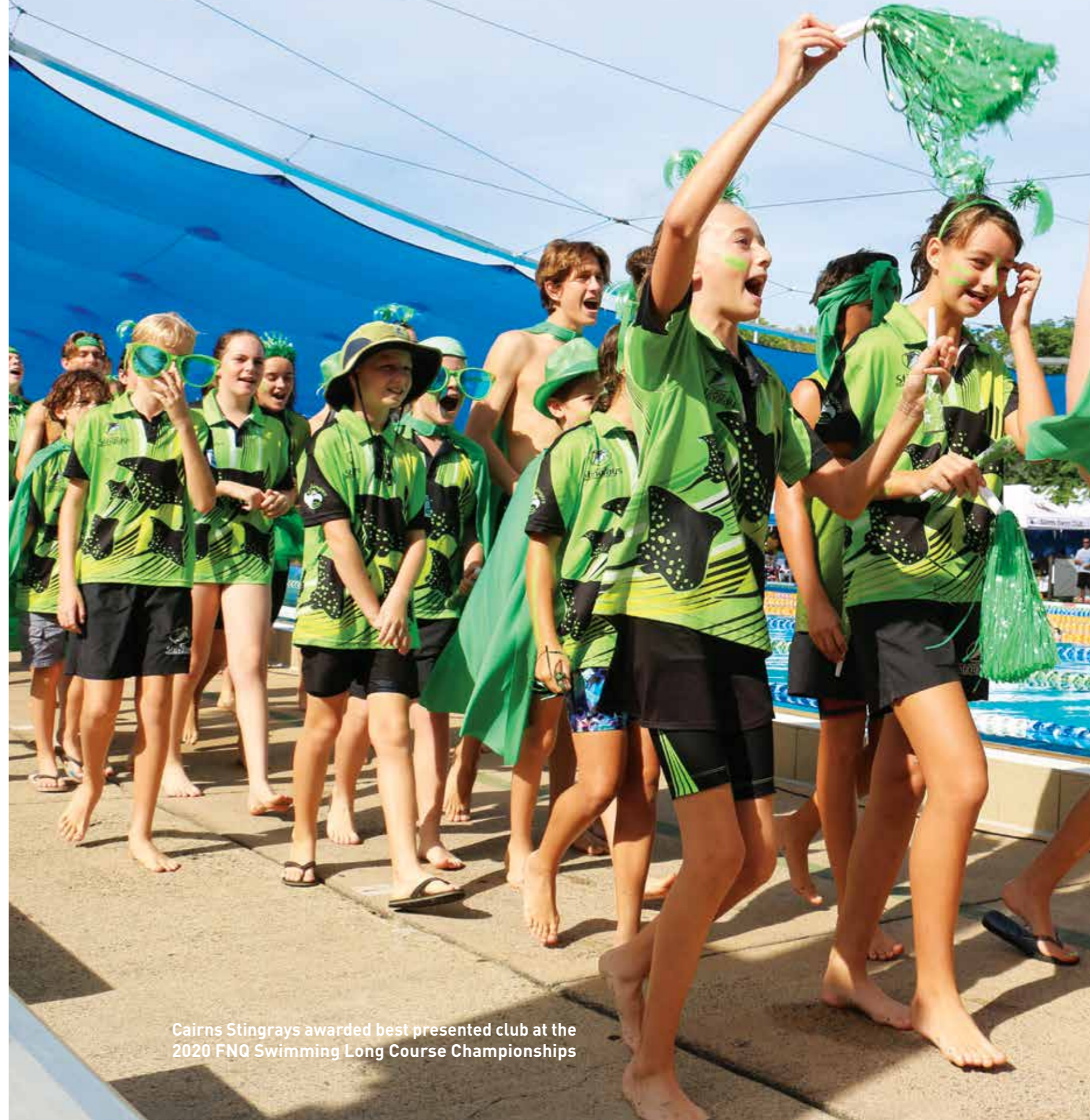
Cairns Stingrays awarded best presented club at the 2020 FNQ Swimming Long Course Championships