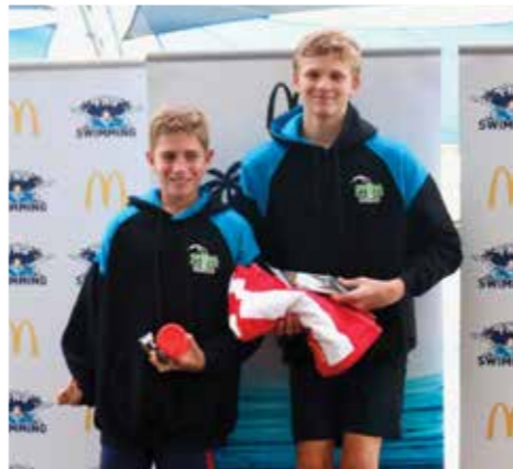
MULTI CLASS CHAMPIONS