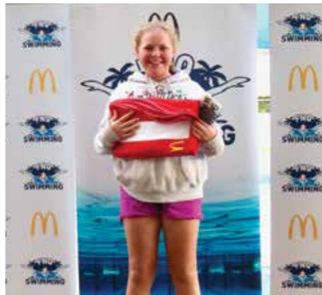
GIRLS AGE CHAMPIONS 10 YEARS