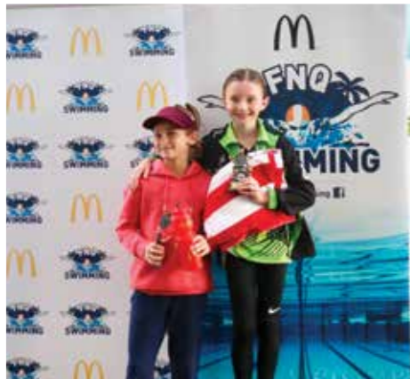
GIRLS AGE CHAMPIONS 8 YEARS