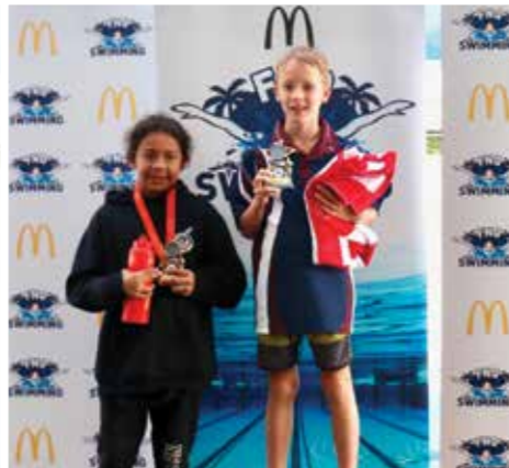
BOYS AGE CHAMPIONS 8 YEARS