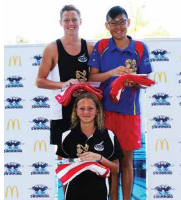
14&U AND 15&0 GIRLS & BOYS FORM STROKE CHAMPIONS