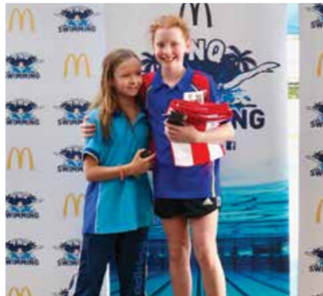
GIRLS AGE CHAMPIONS 9 YEARS