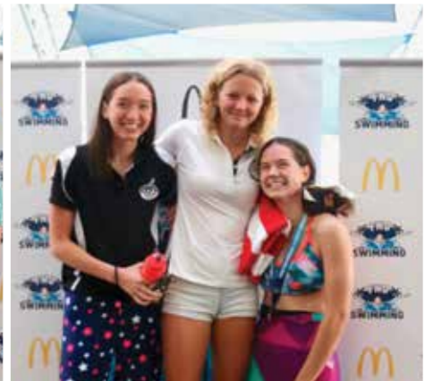
GIRLS AGE CHAMPIONS 15 YEARS