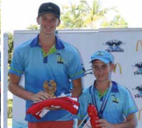
MULTI CLASS CHAMPIONS