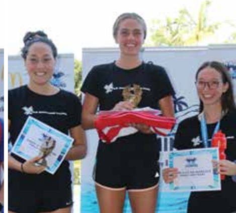
GIRLS AGE CHAMPIONS 16&0 YEARS