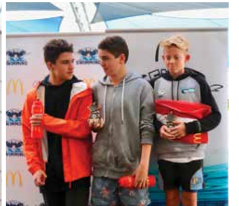
BOYS AGE CHAMPIONS 13 YEARS