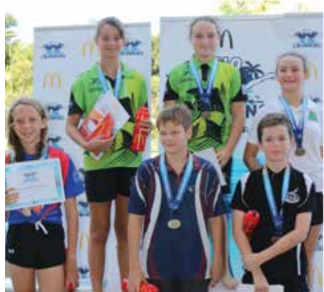
11-12 YEARS COMPLETE MEDAL