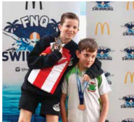
BOYS AGE CHAMPIONS 10 YEARS