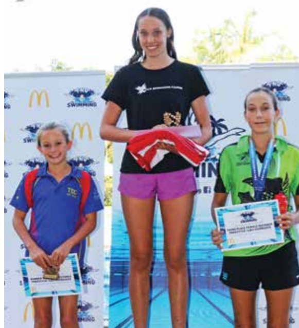
14&U GIRLS DISTANCE FREESTYLE CHAMPIONS