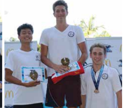
BOYS AGE CHAMPIONS 16&0 YEARS