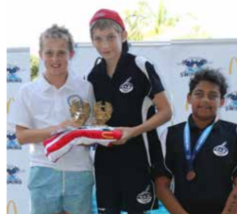
GIRLS AGE CHAMPIONS 12 YEARS