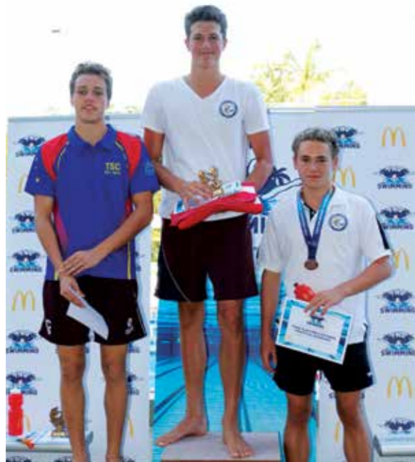
15&0 BOYS DISTANCE FREESTYLE CHAMPIONS