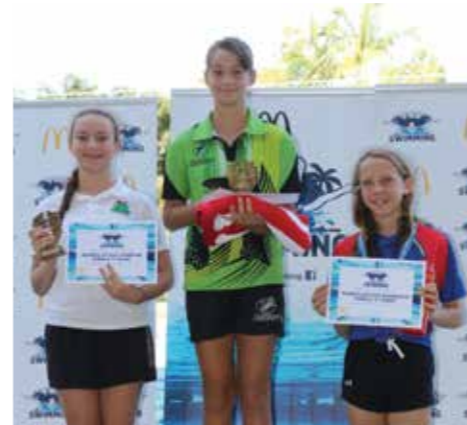
GIRLS AGE CHAMPIONS 11 YEARS